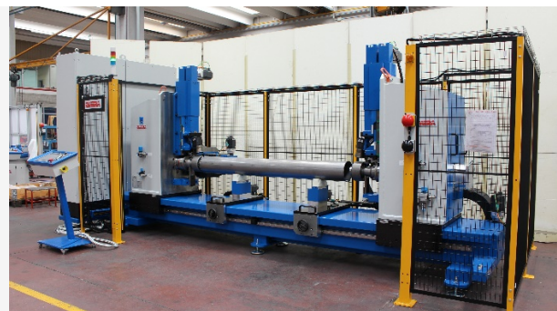
Fig. 1 – 2 Horizontal Trimming-Beading Machine R400-I for tubes 300 – 2000 mm length